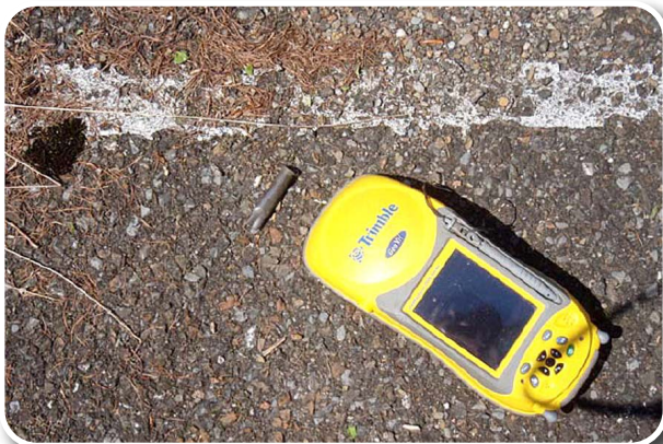
Small arms debris found at the former Presque Isle Air Force Base