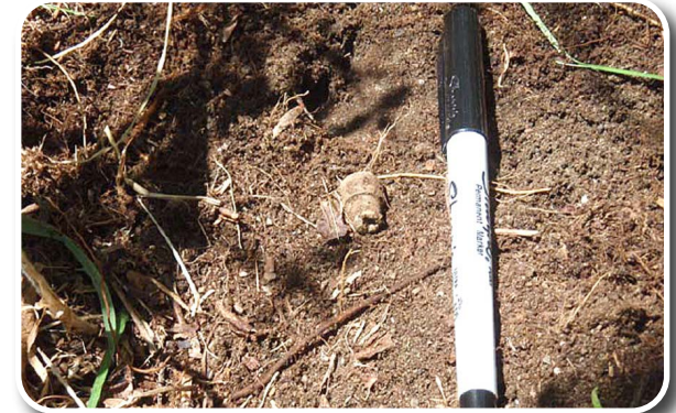
Small arms debris found at the former Presque Isle Air Force Base

A: For more information, call the Formerly Used Defense Sites Information Center toll-free number 1-855-765-FUDS (3837) or select the GIS Tool on the Interim Risk Management page at www.fuds.mil .